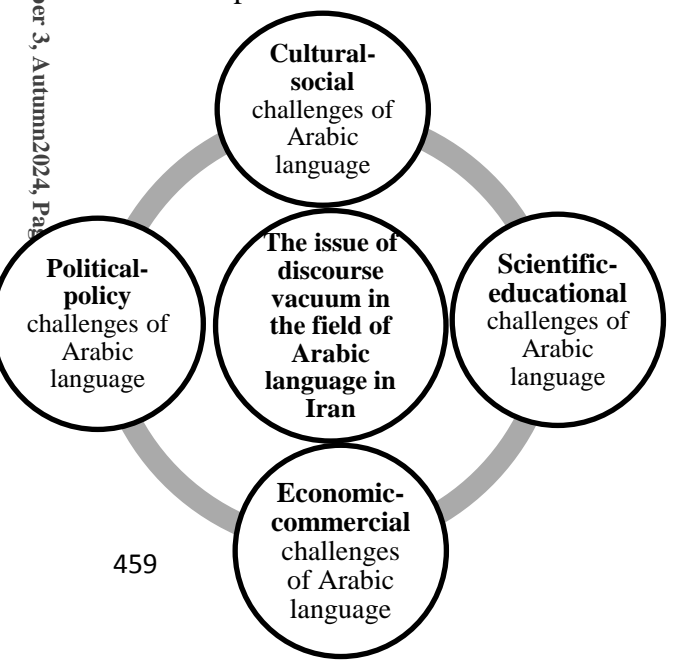
Figure (2): System of Arabic language issues

anthropology, and linguistics, and different philosophers and theorists have proposed various and somewhat different theories about its scope, concept, role, and function, and have had different views about it. Here, discourse refers to the method and approach of policy knowledge and policymaking. Therefore, in this context, the discourse vacuum means the absence of a governance method and policy knowledge approach, and consequently, discourse construction is necessary to fill this vacuum. In general, in humanities and social sciences, discourse describes a formal method of thinking that is expressed through language. In social sciences, discourse is a social boundary that determines which statements can be made about a subject. Many definitions of discourse are largely derived from the works of French philosopher Michel Foucault. Political science considers discourse to be politics close to and policy-making. Therefore, it can be said that the most fundamental challenge of the Arabic language in Iran is the lack of a common discourse in the field of Arabic language. Finally, the system of Arabic language issues can be depicted as follows: