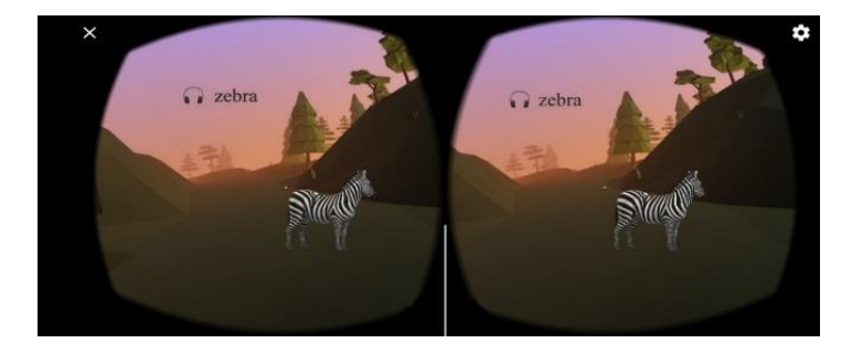
Figure 1. VR environment for animal category