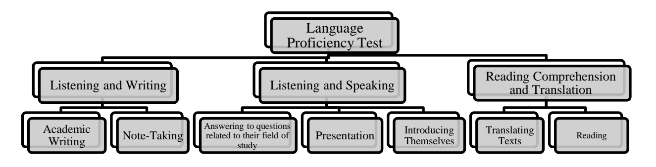
Figure 3. The Proposed Format for English Language Proficiency Tests Based on the Four Skills